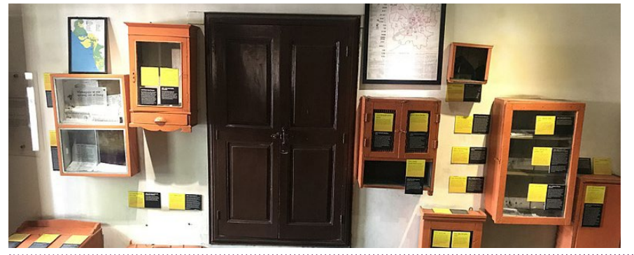
Conflictorium Museum, Ahmedabad

Another alternative museum is Conflictorium, a museum on conflict in Ahmedabad, Gujarat that contemporises the history and discourse of social conflict using participatory methods of engagement. Exhibits and realia in the museum are arranged into seven thematic installations that deal with different views on conflict - conflicts faced in society as well as people's memory and experience of conflict. The Memory Lab in the museum invites visitors to place an object they associate with conflict in a jar and write their story behind it, building up "an archive of memories that produces alternate and personal histories" (Seth 2019). The Pipal tree outside the museum is the 'Sorry Tree' where visitors can write an apology and leave its weight on the tree's forgiving branches. The museum also differs from existing history and ethnographic museums as well as contemporary art museums in the way it positions itself. Conflictorium defines its role as not just a space for staging thought-provoking art and ideas; but instead envisions itself as a social impact agent to 'reduce violent tension and to find creative community-led solutions to conflict' (Conflictorium 2019).