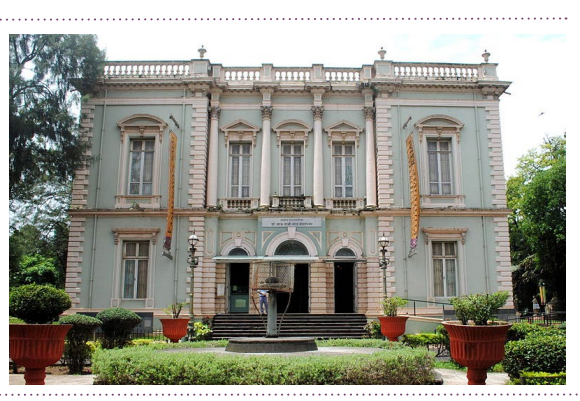
Left: A cabinet of curiosities

Right: Dr. Bhau Daji Laad Museum, formaly known as Victoria and Albert Museum in the city of Mumbai