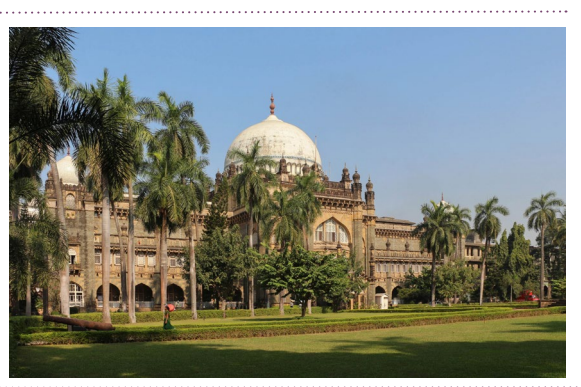
Left: Visitors at the National Museum. Delhi

Right: Chhatrapati Shivaji Maharaj Vastu Sangrahalaya (CSMVS) Museum, formaly known as Prince of Wales Museum, Mumbai